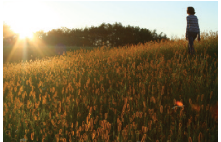
Elenore Zander '09 Silver Portfolio Winner