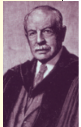
George Plimpton, class of 1873, was a trustee of the Academy for 32 years.

Trustees Thomas Lamont and Jeremiah Smith, both class of 1888, in a picture taken at their 40th reunion in 1928.