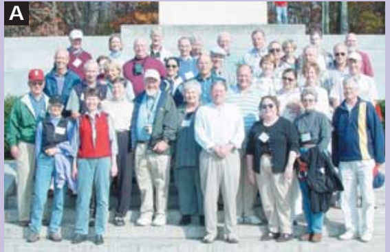
(A) The group assembles at the Eternal Flame