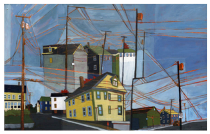
Stacey Durand, Powerlines: Exeter to Newburyport , 2012, Acrylic, graphite, and collage on panel

Our hope with this exhibition is for our visitors [to] discover the hidden talents of colleagues, teachers, staff members and friends. We also hope this exhibit inspires all of our visitors to explore their own creativity, self-expression or discover a greater appreciation for the arts," she says.