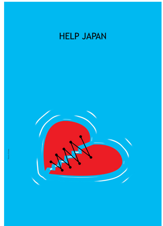
Oriany Pouria, Help Japan

Graphic Advocacy runs concurrently with other projects on campus exploring social justice. These include workshops and other events that ran concurrently with MLK Day. Read the article about these events in the Lion's Eye - “MLK Day 2016: At the Crossroads of Liberation, Oppression and Solidarity” .