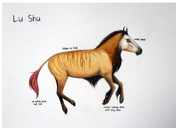
Lu Shu, 2019, Colored pencil and watercolor